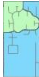
Map of PSUSD Palm Desert Boundaries

Add Blue Section to District 3 on Map102c: